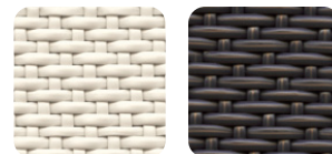
Oval Sunloom White