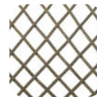
Flat Trendyrope Cocoa mix