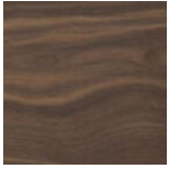
NOCE CANALETTA Canaletta Walnut