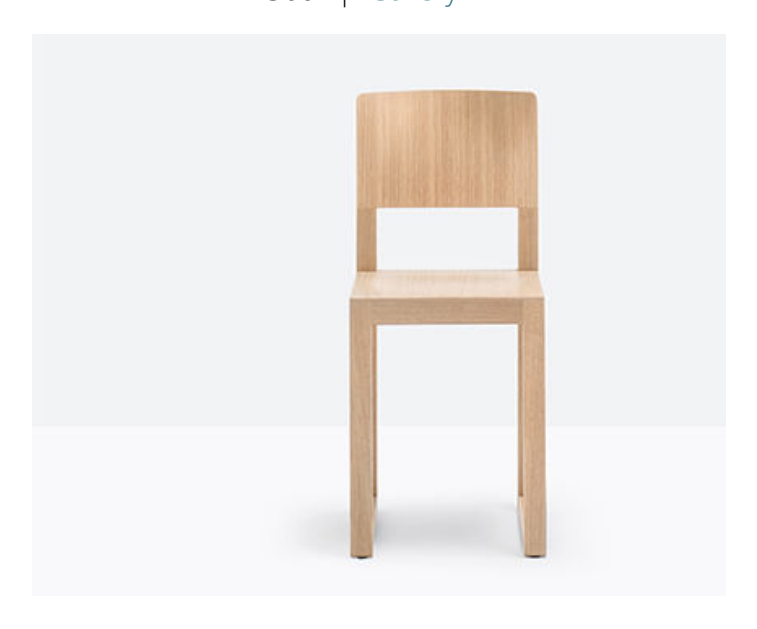
360° | Gallery