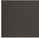
524 Varnished Gun metal