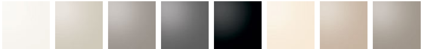
L01 Gesso L8B Caolino L9G Ostrica L6B Grigio Pietra L14 Nero L02 Talco L9F Sand L4G Argilla