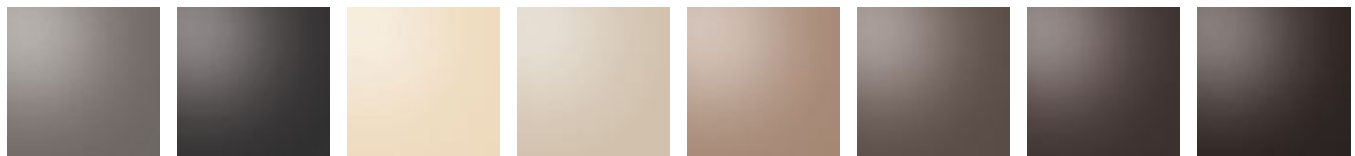
L8C Cappuccino L5B Grigio Lava L72 Sabbia L8A Beige L9T Toffee L93 Melange L13 Sepia L09 Wengè