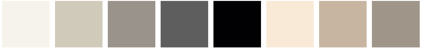
01 Gesso 8B Caolino 9G Ostrica 6B Grigio Pietra 14 Nero 02 Talco 9F Sand 4G Argilla