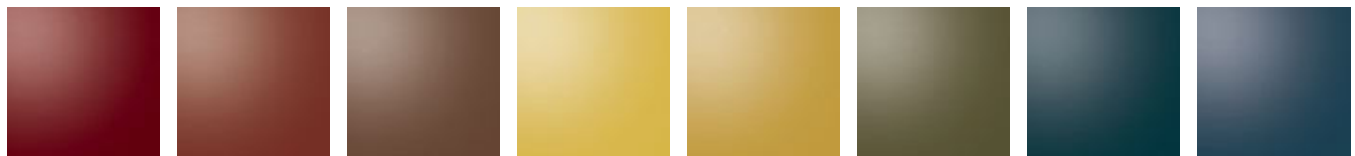
L81 Fuoco L94 Marsala L95 Ruggine L8S Giallo L9B Senape L98 Oliva L9H Petrolio L9E Deep Blu