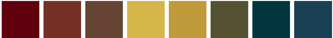
81 Fuoco 94 Marsala 95 Ruggine 8S Giallo 9B Senape 98 Oliva 9H Petrolio 9E Deep Blu