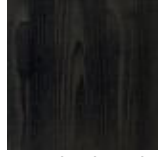
51 Black oak