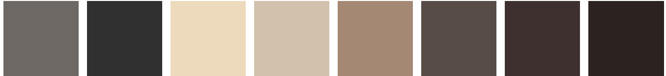
8C Cappuccino 5B Grigio Lava 72 Sabbia 8A Beige 9T Toffee 93 Melange 13 Sepia 09 Wengè