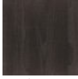
53 Elm grey