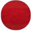
Diamond, glossy red X121