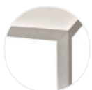
Reconstructed marble white Carrara X120