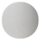
reconstructed stone X084