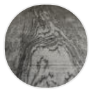
Carbonised wood X094