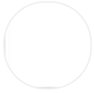
Solid surface white 3mm X035