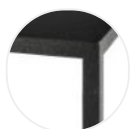
Reconstructed marble black ebony X111