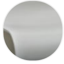
matt white polyethylene