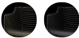
Matt painted bronze X100 Matt painted black nickel X101