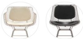
Ivory leather col.28 Black leather col.2