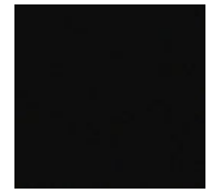
Nero goffrato Embossed white