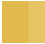
Ottone lucido Satin stainless steel