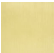
Laccato ottone satinato Embossed black