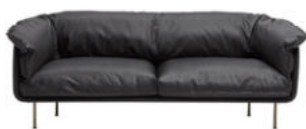
Winnie Sofa 200 FG 483.01