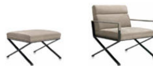
Sahrai Pouf FG 471.01