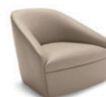
Hollow FG 482.01