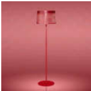
Twiggy Grid Lettura