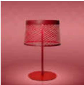
Twiggy Grid XL