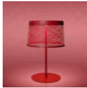
Twiggy Grid XL