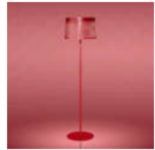
Twiggy Grid Lettura