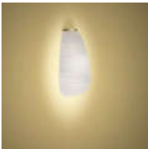
Rituals 1 Mix&Match