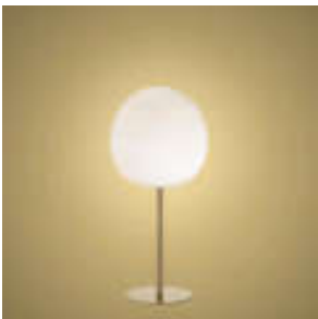
Rituals XL Mix&Match