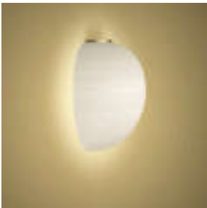
Rituals XL Mix&Match