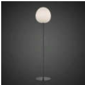
Rituals XL Mix&Match