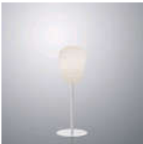
Rituals 1 Mix&Match