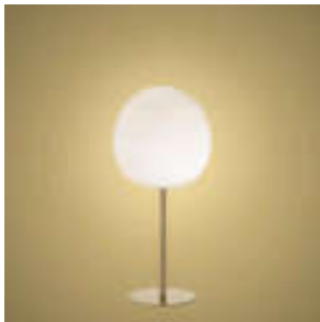
Rituals XL Mix&Match