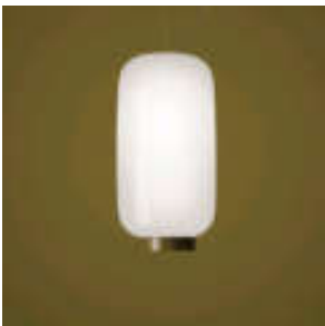
Chouchin Reverse 2