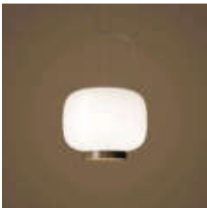
Chouchin Reverse 3