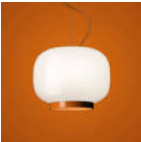
Chouchin Reverse 1