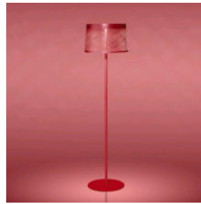
Twiggy Grid Lettura