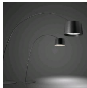
Twice as Twiggy