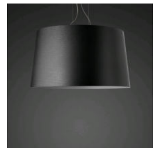
Twice as Twiggy