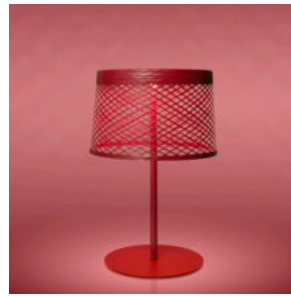
Twiggy Grid XL