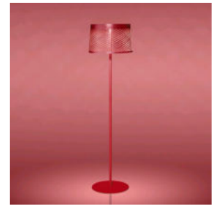
Twiggy Grid Lettura