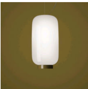
Chouchin Reverse 2