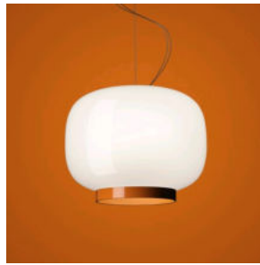
Chouchin Reverse 1