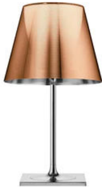
Table luminaire providing diffused lighting. Base, rod support and diffuser support in diecast, polished and chrome-plated Zamak alloy. Base cover in black injection-molded PA (Nylon). Injection-molded PC (polycarbonate) opal inner diffuser. Outer diffusers in transparent or fumée PMMA (polymethylmethacrylate), and silver or bronze on the inner surface, by vacuum aluminum coating. Injection-molded PC (polycarbonate) upper ring, completely transparent or transparent diffuser and silver diffuser) or transparent brown for the outer bronze diffuser.