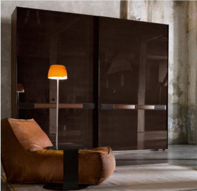
design: Terri Pecora

Wardrobe with sliding doors and with an elegant look, characterized by a very particular bi-colored hard leather belt, which makes this wardrobe one of its kind. The belt can be put only on one door or on all doors.