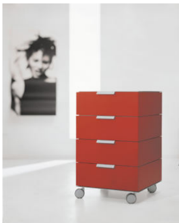
design Pietro Arosio

The basement is always in aluminium finishing while the top can be in the same finishing of the drawers or in aluminium finishing as well. The drawer units can be fitted with castors.