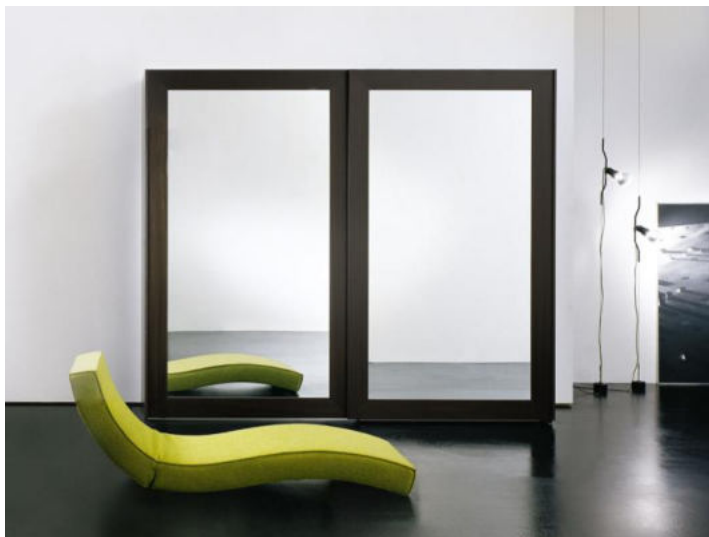
design: Pietro Arosio

Simplicity is the main feature of the wardrobe Passe-Partout, which also in its name declares that it can be adapted to any space. The doors are always characterized by a large frame with 45° cutting on the edges which holds a mirror or a panel available in different finishes.