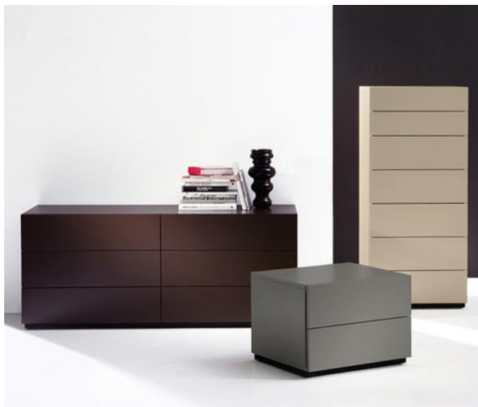
design: Pietro Arosio

Haru is a family of containers with drawers characterized by an extreme formal purity and by an essential line. The only aesthetic grant is a profile placed between the structure and the drawers which can be in the same finish of the drawers or in a different one. Haru collection is also available covered with precious leathers chosen by the client.