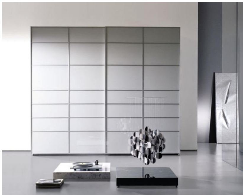
design: Pietro Arosio

Sliding doors with aluminum profiles on the front which form a grid with coloured lacquered glass panels inside. The profiles are in natural anodized aluminum, thus creating a light and harmonious grid.