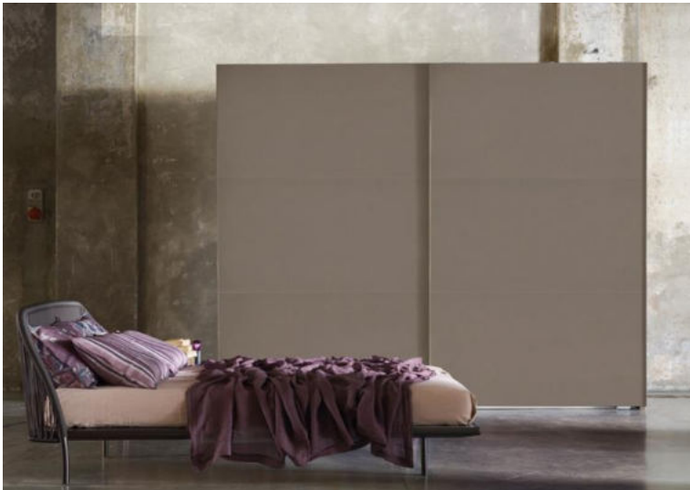
design: R&D EmmeBi

Wardrobe with two or three sliding doors with an elegant look: when it is closed it is like a very essential plain one-colour surface, adaptable to any space.