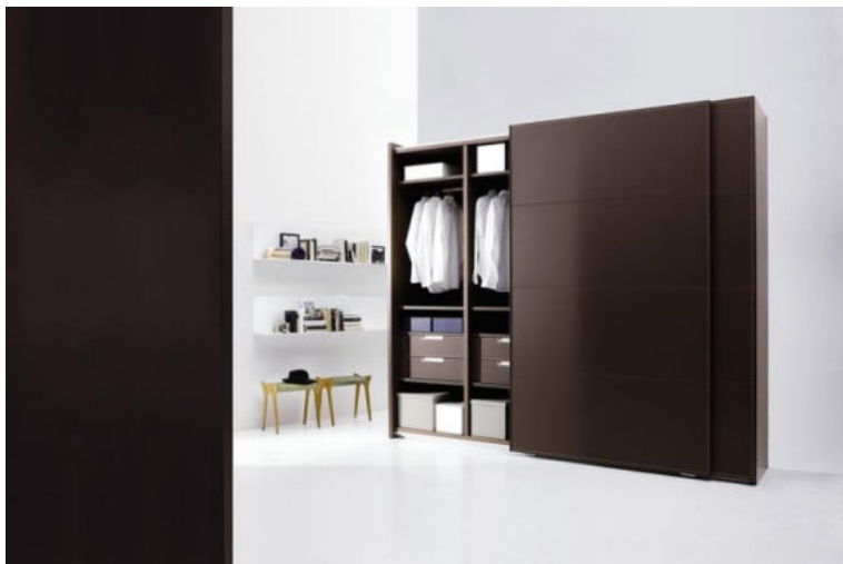
design: Pietro Arosio

Modern lines and handcraft finishing are the main features of Arkon: its sliding doors are completely covered with regenerated hard leather with seams in a contrasting colour or in the same one as the doors.