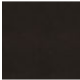
GFM18 bronze embossed