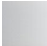
GFM71 white embossed