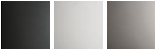
OP69 matt graphite