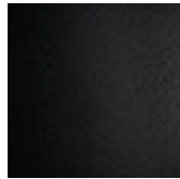
GFM73 black embossed