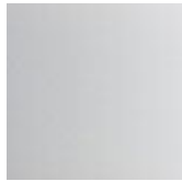
GFM71 white embossed