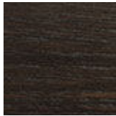
RB burned oak