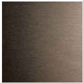
11 satin titanium