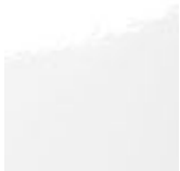
L7 polished white lacquered