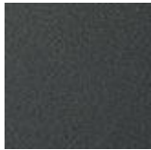
GF69 embossed graphite