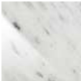
BC polished white Carrara