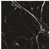
NM polished black Marquina