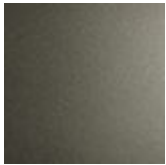
GFM11 titanium embossed