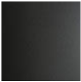
OP69 matt graphite