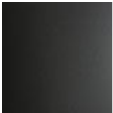
OP69 matt graphite