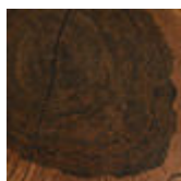
Mdf veneered in log section of walnut