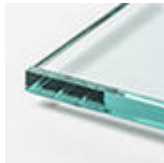
extra light transparent