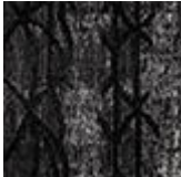
cotton chenille Mumbai