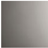
polished stainless steel