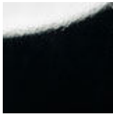
L3 polished black lacquered