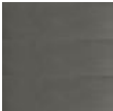
OPO transparent varnished