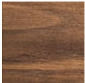
NC walnut canaletto