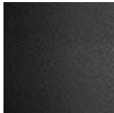
GFM69 graphite embossed