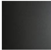
OP69 matt graphite