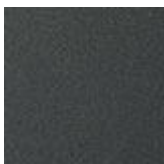
GF69 embossed graphite