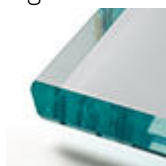
bevelled extra clear