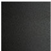
GFM69 graphite embossed