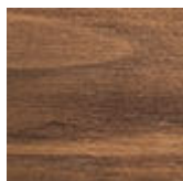
NC walnut canaletto